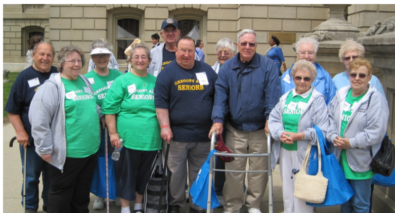
Members of the Gregory Senior Center in Livingston County