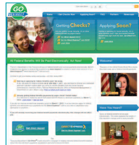
Go Direct website. www.godirect.org

Current beneficiaries will have until March 1, 2013 to make the transition, but the Treasury is encouraging beneficiaries that are receiving checks to act sooner rather later. "I urge everyone receiving a paper Social Security or Supplemental Security Income check to switch to electronic payments now,